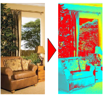
gular Window Red Areas indicate Heat

Heat flow through windows is best shown graphically in thermal imaging. Red areas indicate heat while Green areas indicate cool temperatures.